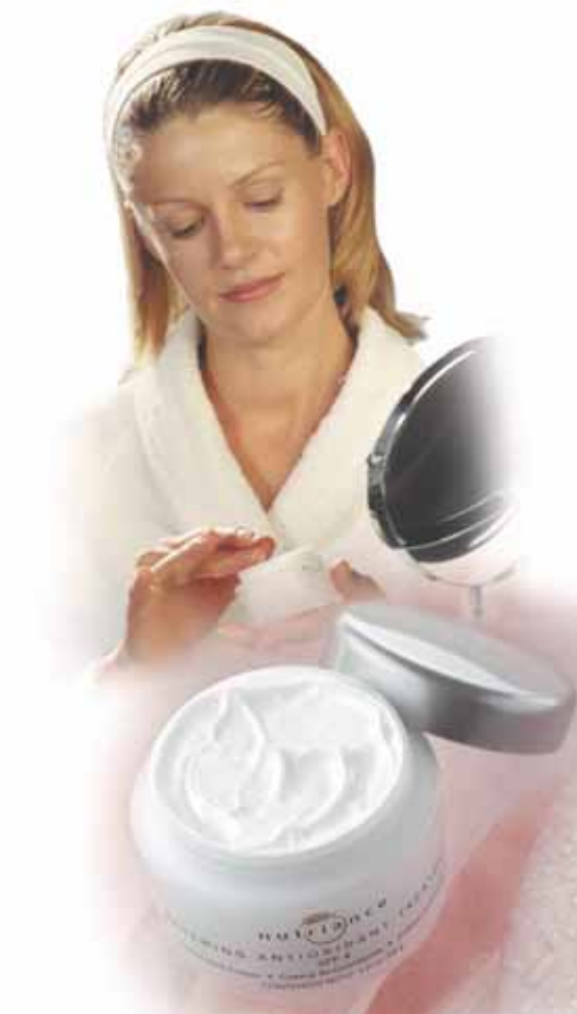
Test results proved Renewing Antioxidant Treatment erases the appearance of small lines and wrinkles by as much as 28% in just 28 days.

As the name suggests, Renewing Antioxidant Treatment is rich in natural antioxidants, including lipid-soluble vitamins A & E and water-soluble vitamin C, plus the natural antioxidant power of Green Tea. Our clinical results showed as much as 90% increase in the skin cells' natural antioxidant capacity.