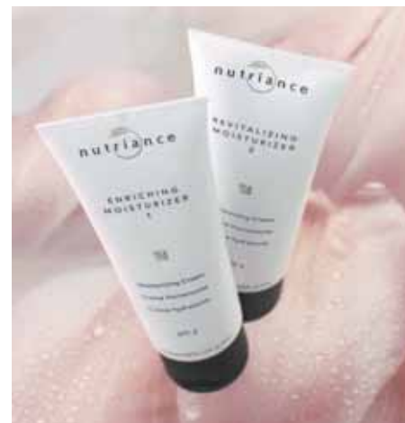
Enriching Moisturizer 1 and Revitalizing Moisturizer 2 keep skin well hydrated for hours.

When you use our new Renewing Antioxidant Treatment, you will experience benefits on an even greater scale. This product truly represents the leading edge of skin care science. It delivers groundbreaking ACR. Clinical tests show that exclusive ACR delivers metabolic accelerators to speed up cell metabolism naturally, making skin not only look younger, but act younger.