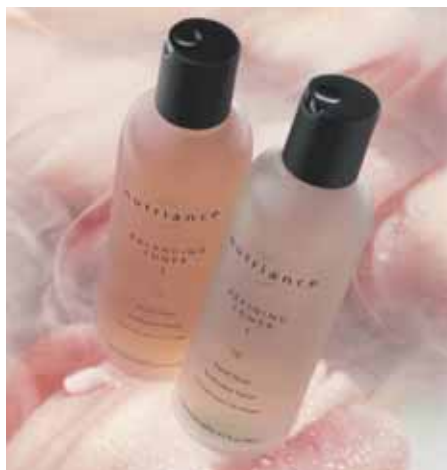
Refining Toner 1 and Balancing Toner 2 soothe, firm, and support natural pH.

This is all achieved with natural herbal extracts, including Witch Hazel and Tormentil to help turn down lipid production and re-establish an optimal moisture balance.