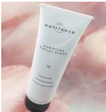
Purifying Facial Scrub increases skin smoothness by 30%.