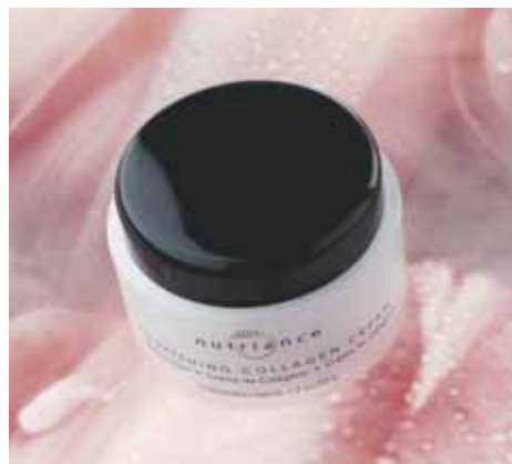
Nourishing Collagen Cream and Aloe Vera Gel work together to help you look younger, longer.

The new Nutriance is Youth Renewing, Skin Protecting and Age Defying. With Nutriance, we can actually slow, stop and even reverse the signs of aging. And we have the science to prove it!!